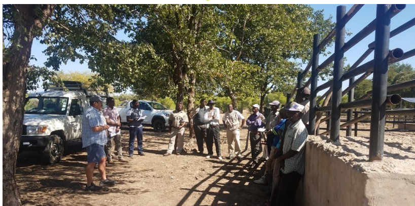
BEST conducting a Cattle Business Centre Assessment with Koala Meats in Mt. Darwin District.

To facilitate this process, the project trained 40 enumerators and milk mapping commenced in May 2019. To date, milk mapping data collection has been completed in the provinces of Bulawayo; Harare (Harare peri-urban and Seke); Matabeleland North (Binga, Hwange, Lupane and Nkayi) and Matabeleland South (Gwanda, Insinza, Mwangwe, Beitbridge).