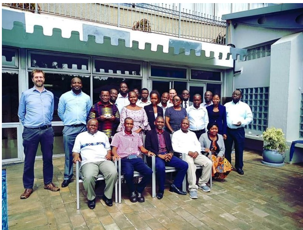
The ZAKIS team meeting to develop the work plans.