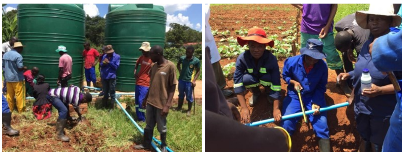
Students at Chibero College of Agriculture being trained on installing a drip irrigation kit earlier this year. In turn, they will use these skills to train farmers.

The agricultural centres of excellence will also be at the forefront of developing digital innovations such as innovative software applications (apps) and communication tools where farmers can access mobile based extension which is digitally interactive and pluralistic. An example is the Kurima Mari mobile application where Agritex has already taken a leading role in content development and management for the greater good of Zimbabwean extension.