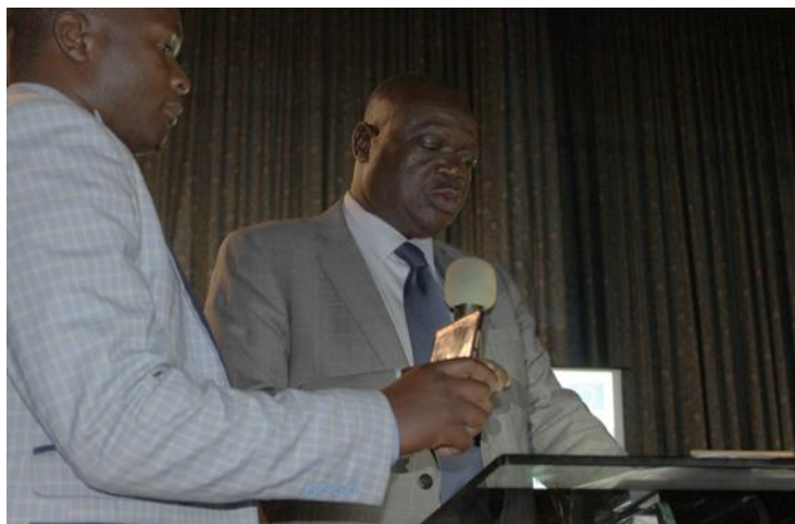
Hon Air Chief Marshal Perrance Shiri (Retired), the Minister of Lands, Agriculture, Water, Climate and Rural Resettlement, giving the keynote address at the launch.