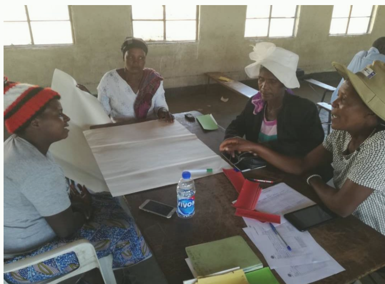
Gokwe women farmers in consultation for the development of Kurima Mari Beef mobile application.

The ICT4D component will play a pivotal role in supporting extension services in the BEST project. Tailor made information technology innovations will be embedded in project activities to ensure successful achievement of project deliverables.