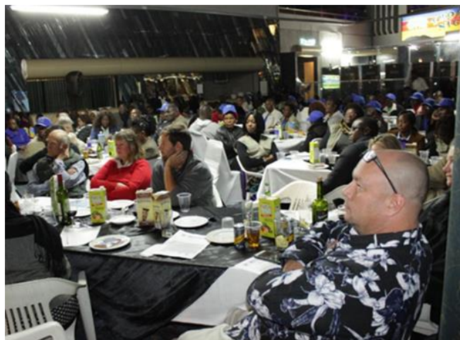
The launch event was attended by at least 200 people including dairy farmers, farmers' associations, government officials, and the private sector.

The Transforming Zimbabwe's Dairy Value Chain for the Future project was officially launched on 17 July 2019 in Nyanga district, in Manicaland Province. The EURO seven million project is being implemented by We Effect, in partnership with the Zimbabwe Association of Dairy Farmers (ZADF), Zimbabwe Farmers Union (ZFU) and Zimbabwe Dairy Industry Trust (ZDIT) launched the project. At least 300 people attended, including dairy farmers, farmers' associations, government officials, and the private sector.