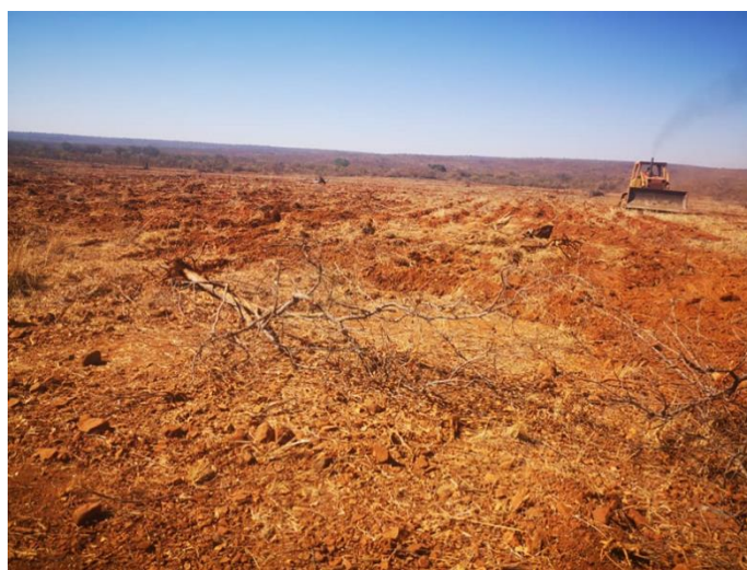
Land preparation underway at Balu Estate, Umguza district.

The sites will establish fodder banks for the surrounding communities for pen fattening, survival feeding and priority feeding. At Balu Estate, to date 60 hectares of land have been cleared and a centre pivot irrigation system will be installed.