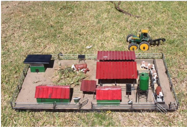
A small-scale model of the Cattle Business Center (CBC).

BEST will capacitate NF by supplying heifers to expand the number of commercial farmer participants up to 100.