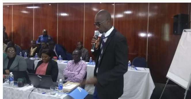
The SAFE inception meetings were attended by stakeholders at national, provincial and district levels.